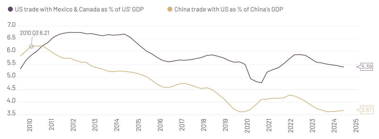
CHART 1: THE US TRADES MORE WITH CANADA AND MEXICO THAN CHINA DOES WITH THE US, %

Source: Macrobond, US Census Bureau, China General Administration of Customs, China Bureau of Statistics, US Bureau of Economic Analysis, Indosuez Wealth Management.