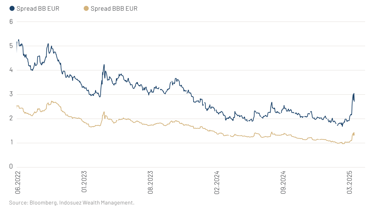
CHART 3: EVOLUTION OF YIELD SPREADS BETWEEN BBB AND BB RATED BONDS IN THE EURO AREA, HUNDREDS OF BASIS POINTS

The decline in banking sector equities is logically reflected in additional tier-1 (AT1) subordinated debt. While the exercise of call options for this year is not in question, this segment requires higher spreads to attract investors again.