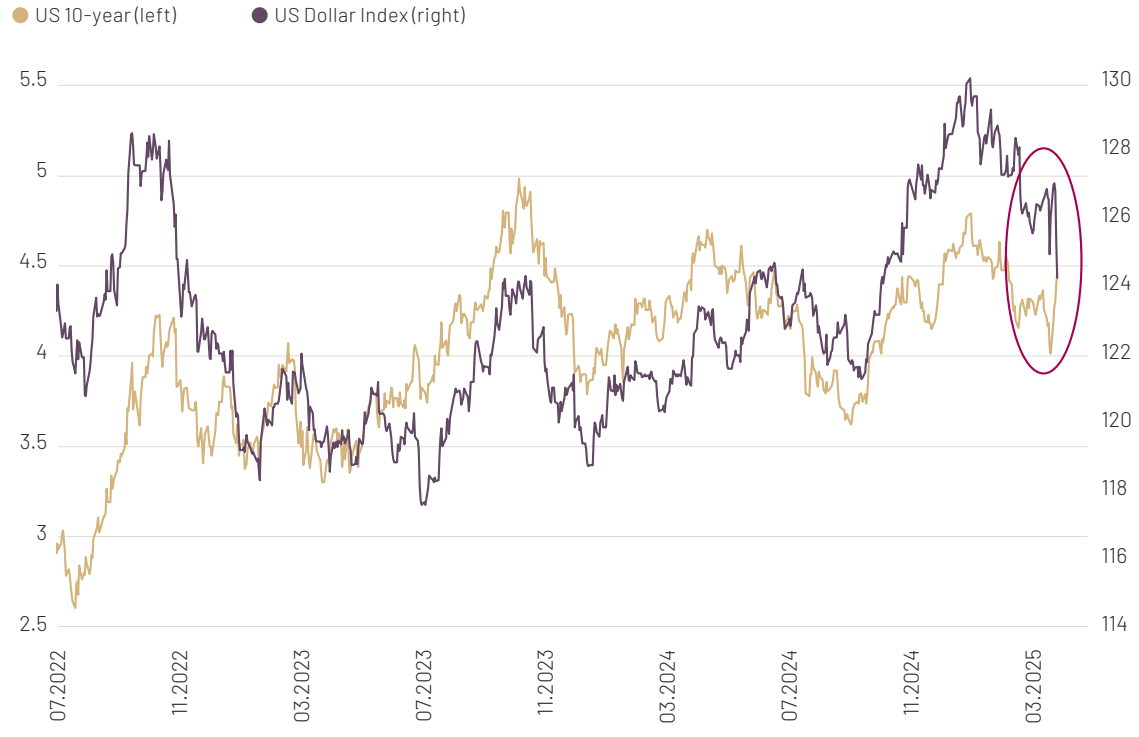
CHART 5: THE DECLINE IN USD/UST CORRELATION REFLECTS EROSION OF CONFIDENCE IN THE USD